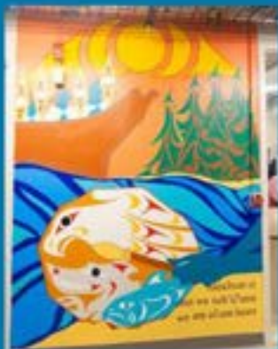
Downtown Eastside Youth Outreach Mural (Credit: Diamond Point)