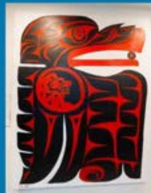
Downtown Eastside Youth Outreach Mural (Credit: Ryan Hughes)