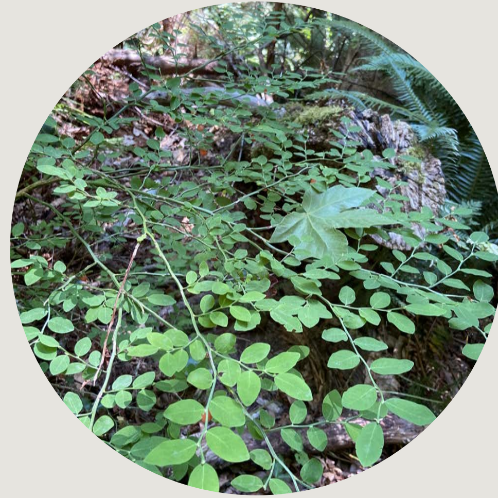
skw'ekwchsáy (Huckleberry bush)