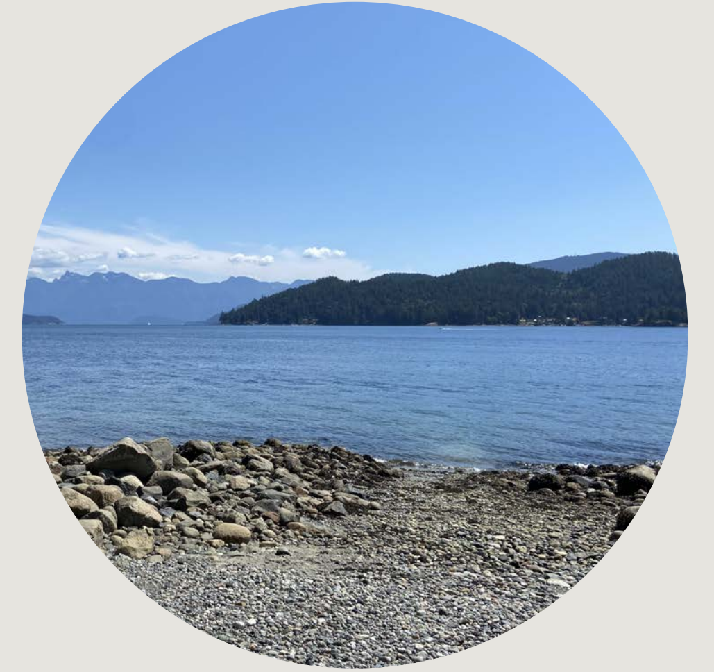
View from the shore